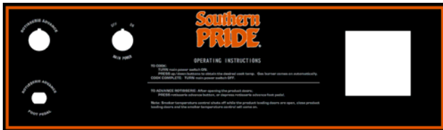
CV Control Overlay

Both the standard CV control panel, and the optional cook and hold control panel, will change in physical size and have a new overlay. The actual controls, switches, and buttons will all remain the same as on the previous control panels. Refer to SPEXPL-001 for the new part numbers associated with the changes. Visually, the new overlays can be identified by the orange Southern Pride logo and overlay trim as opposed to red on the previous overlays.