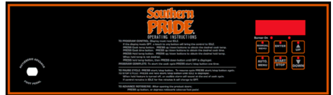
Cook and Hold Control Overlay