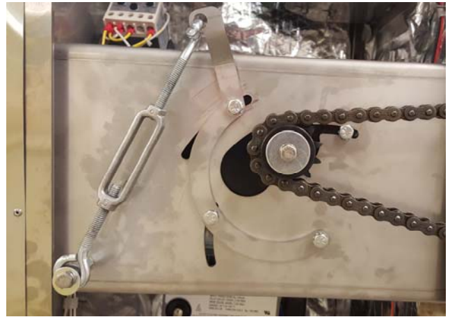
New Turnbuckle Style Chain Tensioner