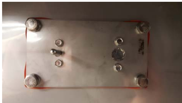
Thermocouple and High-Limit (120v version shown)

The high-limit switch will move from being located on the outside of the service bay in the rear of the smoker to being located on the same panel as the thermocouple at the front of the smoker. The thermocouple and high-limit will remain the same; only the mounting plate and gasket will change.